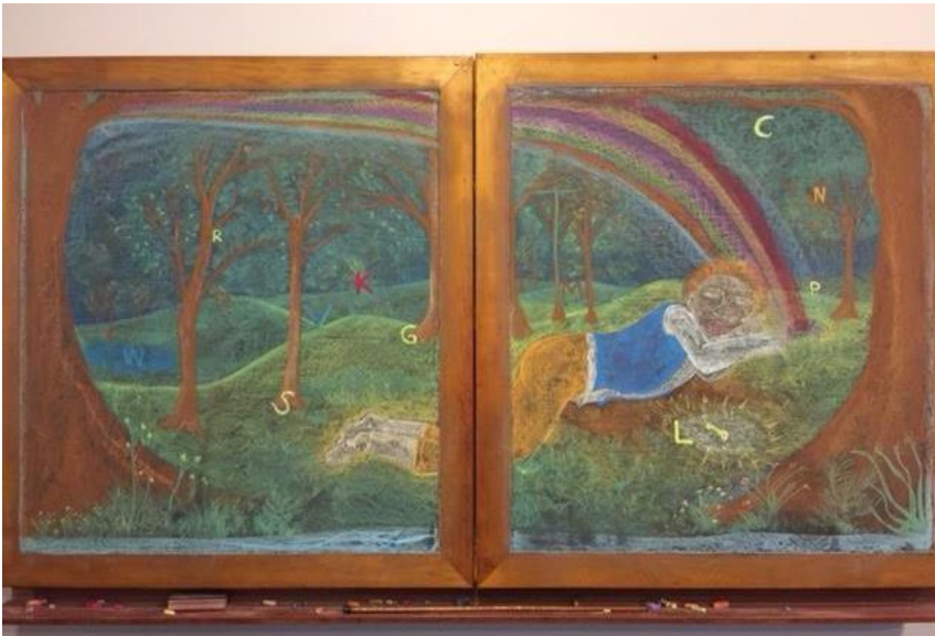
CLASS 1 BLACKBOARD DRAWING