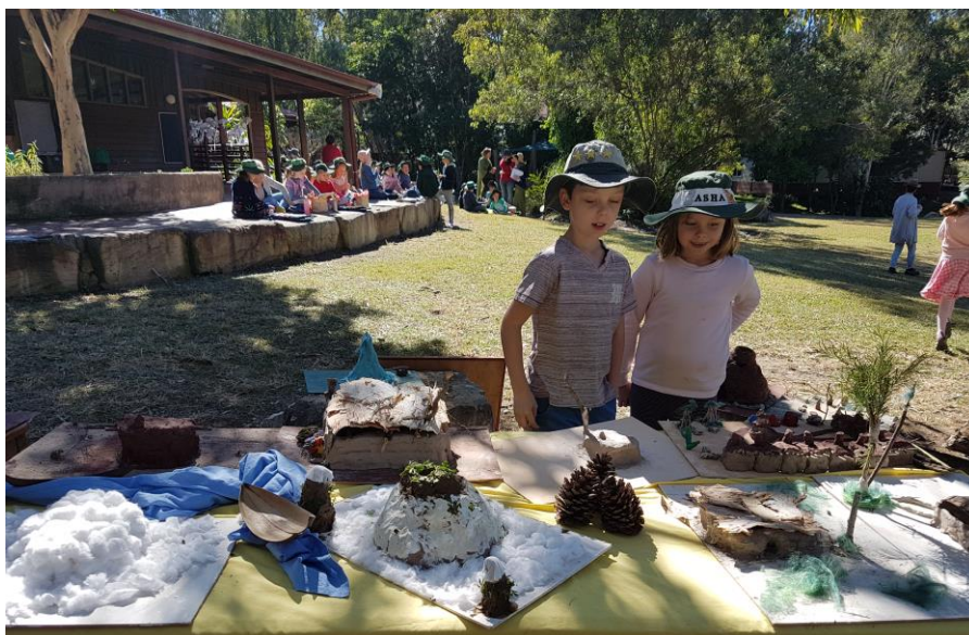
Class 3 - some of the models they made last week