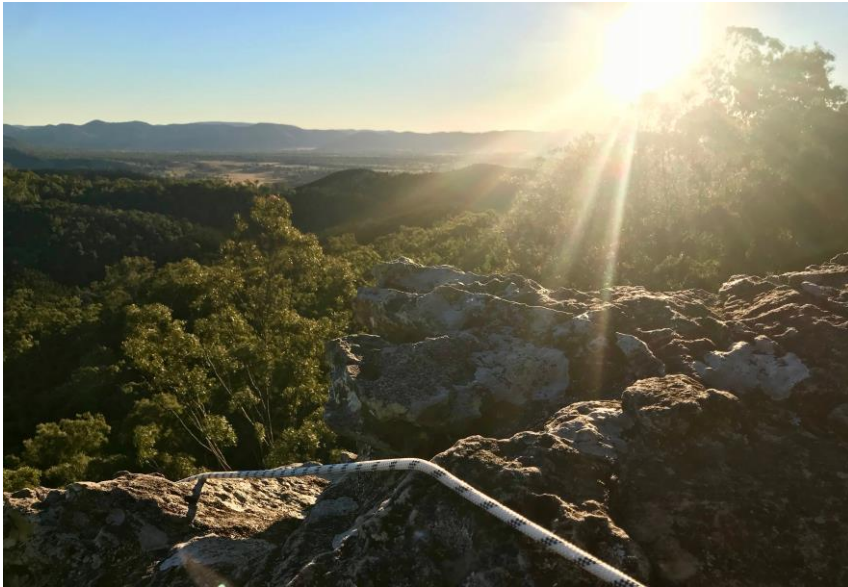
First VET Camp for Year 11 & 12 students