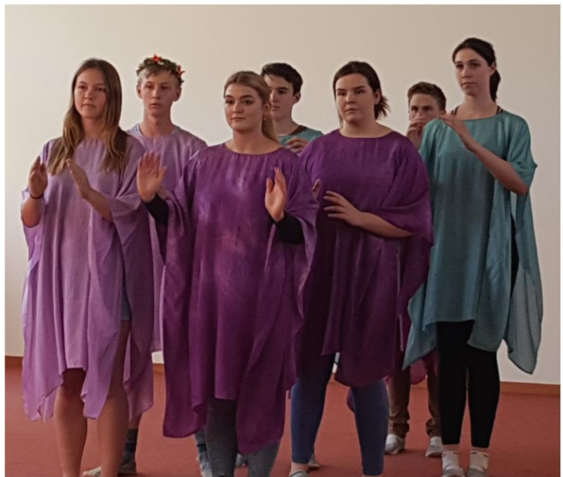
Year 12 students treated Class 4 and admin staff to a Eurythmy performance recently.

Monday 30 October Pupil Free day, except for Pre- Prep