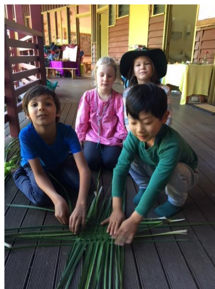
Weaving a grass mat