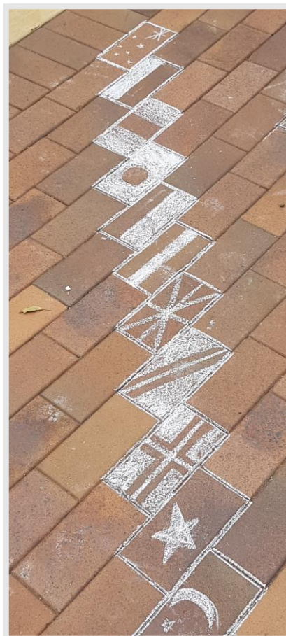
Flags in chalk – This wonderful chalk drawing appeared one day this week!