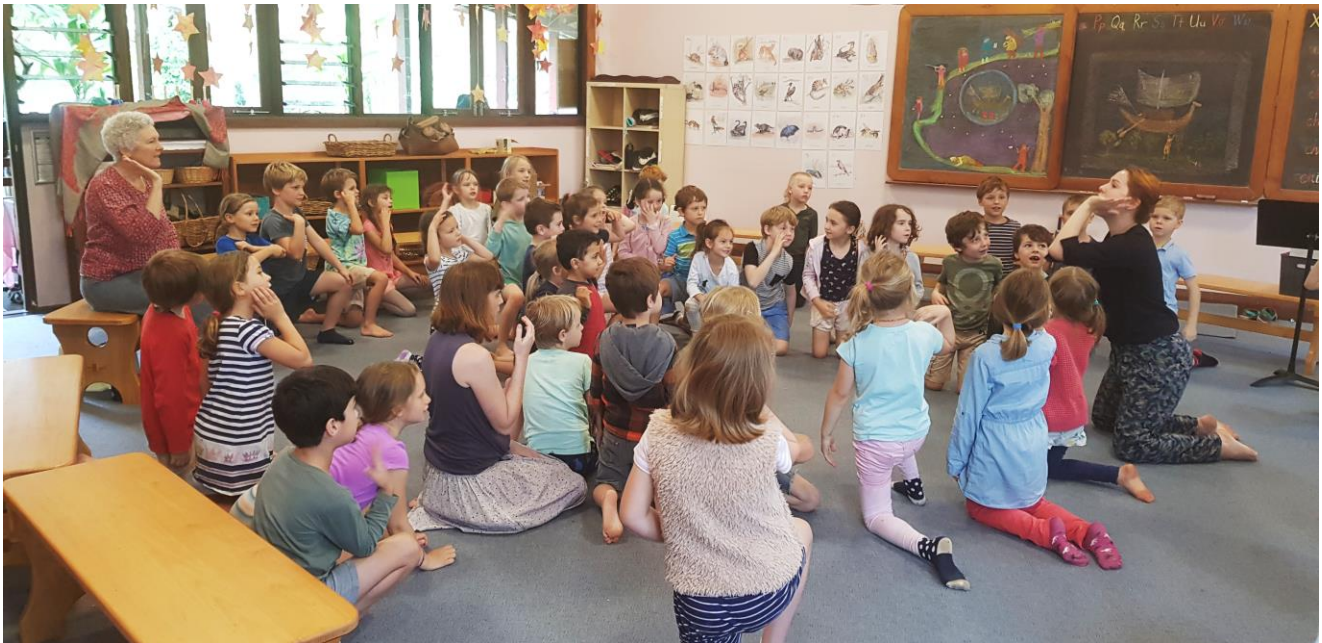
Prep children visiting Class 1 as part of their transition to Class 1 programme.