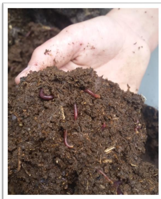
A handful of a gardener’s best friend, the composting worm.